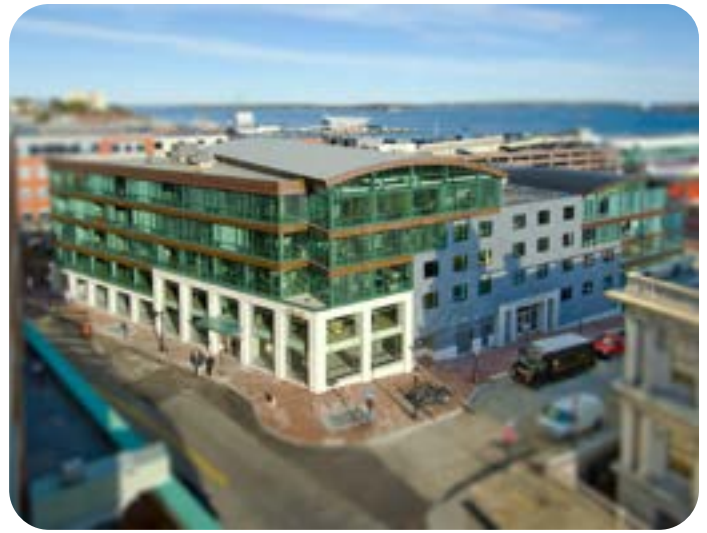
Southern Maine Office