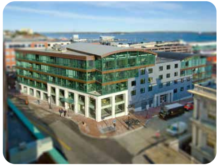
Southern Maine Office