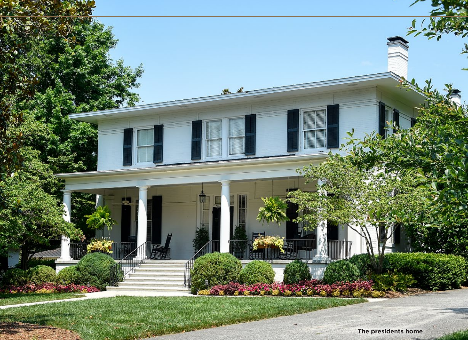
The presidents home